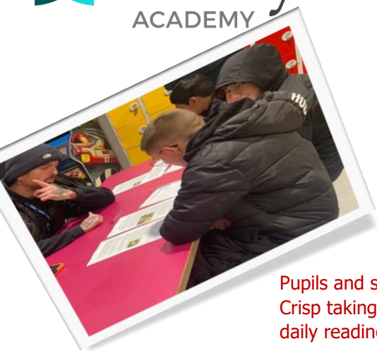
Pupils and staff from Crisp taking part in the daily reading challenge

At Unity Academy, a priority is to develop pupils' love of reading and support those who struggle to read. The Academy has raised the reading profile across the Provider network, focusing on reading for pleasure opportunities and ensuring all pupils can access a reading programme in their provisions. It has been evident during the visits to the Providers and discussions with our pupils that the reading culture has developed in all the settings. Our pupils benefit more from reading opportunities, accessing a wide range of texts embedded across the curriculum.