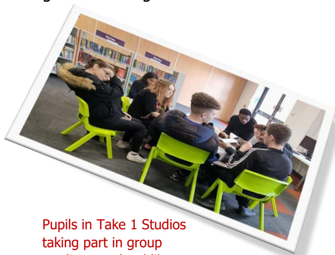
Pupils in Take 1 Studios taking part in group reading at a local library

At Unity Academy, a priority is to develop pupils' love of reading and support those who struggle to read. The Academy has raised the reading profile across the Provider network, focusing on reading for pleasure opportunities and ensuring all pupils can access a reading programme in their provisions. It has been evident during the visits to the Providers and discussions with our pupils that the reading culture has developed in all the settings. Our pupils benefit more from reading opportunities, accessing a wide range of texts embedded across the curriculum.